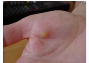
Wart on hand

Remove your skin lesions today! Book an appointment for a free consultation.