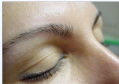
Lesion on eyebrow - 4 weeks after treatment the lesion is gone and the hair follicle remains