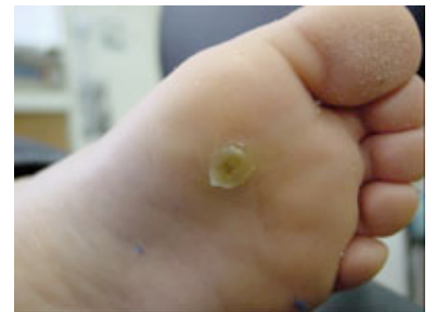
4 Weeks after