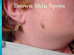
Brown Skin Spots