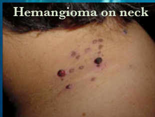
Hemangioma on neck