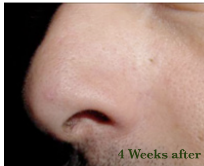
4 Weeks after